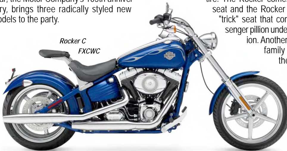
Rocker C FXCWC

Fall is a great time of the year; night-time cruises get cooler, the sunsets are more spectacular and Hutchins begins to fill its showroom with new model year Harley-Davidson's. This year, the Motor Company's 105th anniversary, brings three radically styled new models to the party.