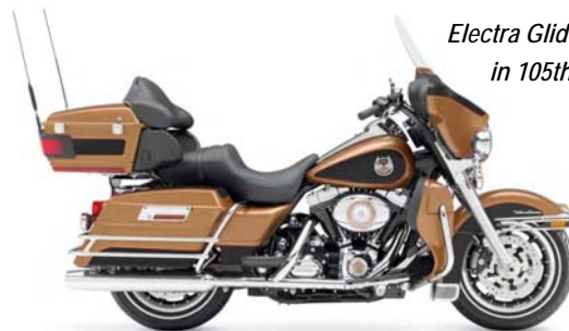
Electra Glide Ultra Classic in 105th Anniversary trim

Street and Road Glides, have received attention as well with larger six-gallon gas tanks (up from five) and new Brembo-sourced brakes with optional ABS.