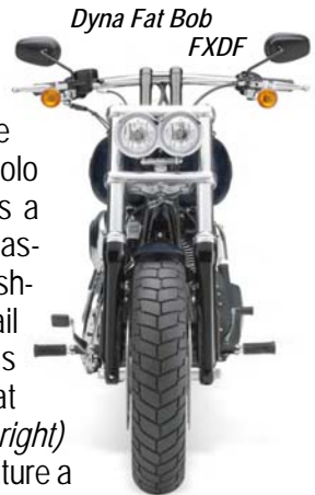
Dyna Fat Bob FXDF

the Dyna Fat Bob ( at right ) will feature a new seat shape and drag bars.